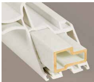
Quality windows use structural reinforcement.

Window Frame & Sash – Custom Made & Reinforced