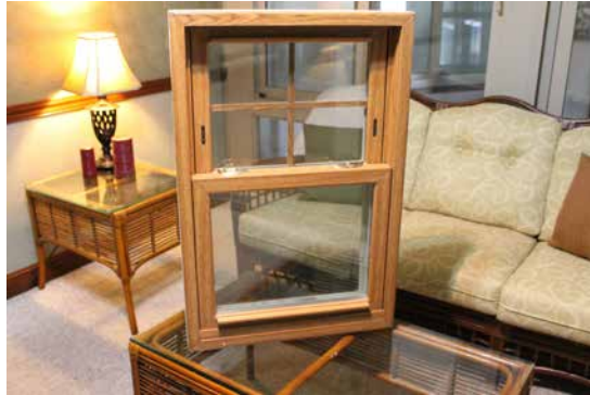
A window company representative should bring a full, working window sample to your home before you purchase.

Remember, new windows should be a one-time investment for your home.