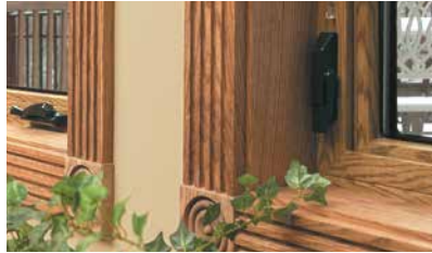
Stanek interior woodgrain finish combines the look of wood with vinyl's durability.

Vinyl also comes in a variety of colors to complement your home. If you like the look of wood but not its upkeep, consider a woodgrain vinyl option. Woodgrain offers the look of real thing without the maintenance headaches.